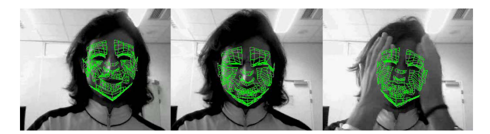
Fig. 7. 3D wireframe face-model fitting for happy, angry, and occluded face images [78]

whereas cortically initiated facial expressions are subject to volitional real-time control and tend to be less smooth, with more variable dynamics [65], [23]. Hence, having computer systems developed and tested only using deliberate (exaggerated) human behavior displays makes this technology inapplicable to real-world (naturalistic) contexts of use.