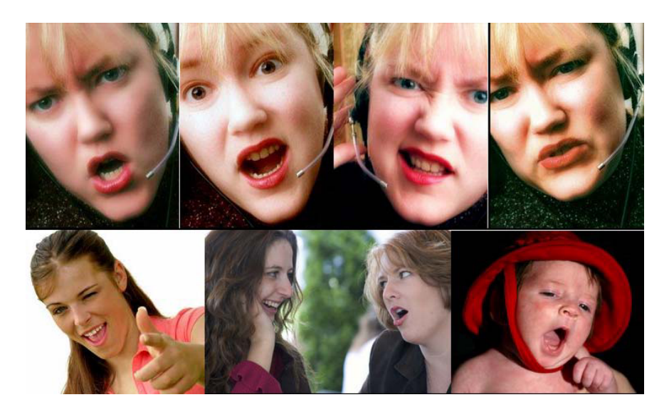
Fig. 2. Types of messages conveyed by behavioural signals. First row: affective states (anger, surprise, disbelief, sadness). Second row: emblems (wink, thumbs up), illustrators and regulators (head tilt, jaw drop, look exchange, smile), manipulators (yawn).