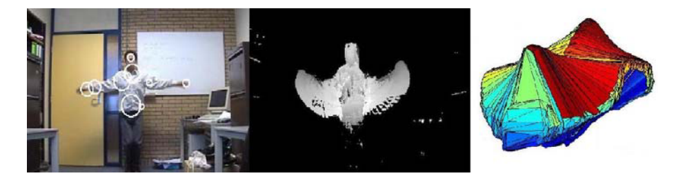
Fig. 5. Human body gesture recognition based on (left to right): spatio-temporal salient points, motion history (i.e., when and where motion occurred), and spatio-temporal shapes [53]

cues for decoding someone's affect/attitude [67], we suggest a much broader focus on machine recognition of these nonlinguistic vocal cues.